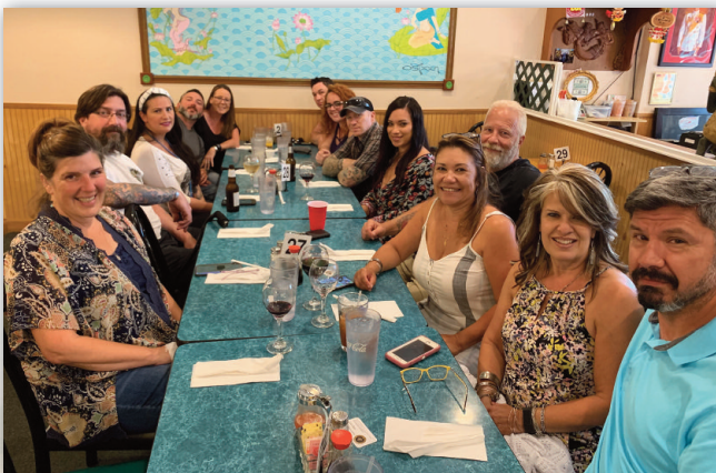
May 2019 Fort Bragg Ambassador Dinner