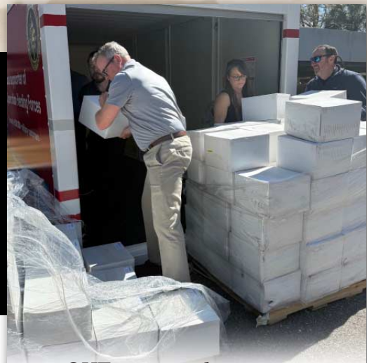
OHF team members prepare 100 weighted blankets for distribution as a resource to support comfort, stress relief, and overall well-being

Each blanket represents a thoughtful investment in the well-being of those who have carried the weight of service. As they are placed into the hands of veterans, they will provide comfort in moments when it is needed most.