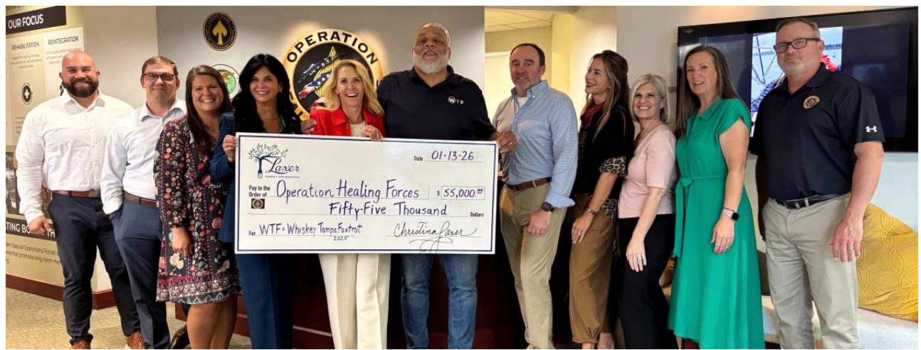
Representatives from the Laxer Family Foundation present a check to Operation Healing Forces at the Tampa office.

An iconic Tampa tradition once again brought people together for something greater than the experience itself.